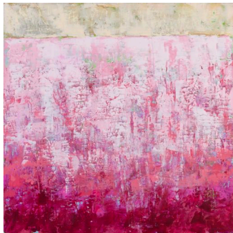
Anya Leveille, Cherry Trees

June 22nd – July 27 th Opening Night: June 22 nd 6 – 8 pm