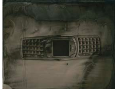
Muzi Rowe, Phone Portrait 8, Wet Plate Collodion Tintype