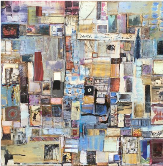
Glimpses (2015) Adrienne Shishko Mixed Media 20 x 20