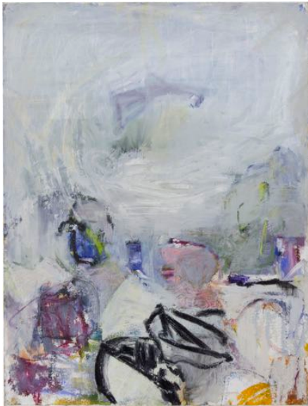
Tossed (2016) Betty Canick Mixed Media 23 x 30