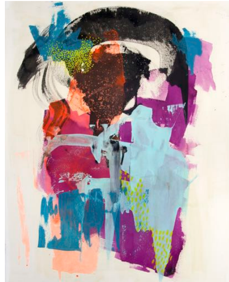
Diamonds & Pearls (2017) Aja Johnson Mixed Media 22 x 30